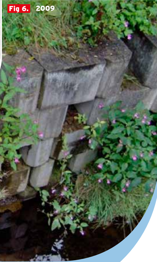
Fig 6. 2009